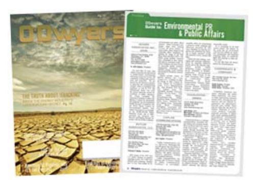
Feb. '12 Environmental PR & PA Magazine Magazine

O'Dwyer's magazine, now in its 26th year, is the #1 publication for PR and marketing communications pros....Subscribe today